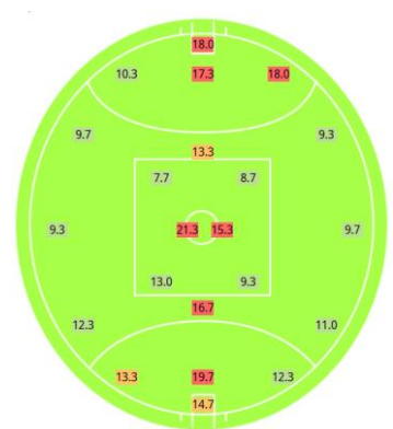
Aldridge Oval Australian Rules Football